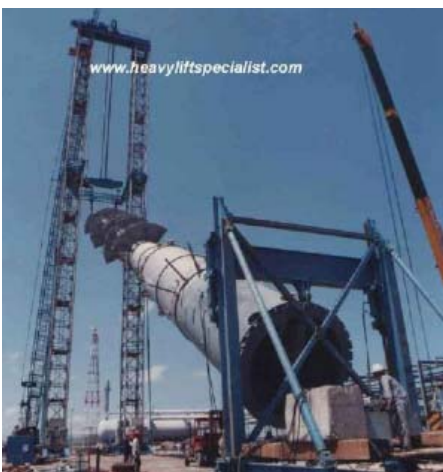
Erection of a 220 Tons column with an unguided lift gantry in Kerteh Malaysia, project was carried out in close co-operation with freight forwarder Kontena Nasional