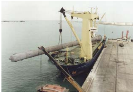
Shipment and Transport of Heavy Columns for TPI Refinery Rayong, Thailand