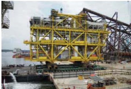
Load-out of two compression modules (1750 Ts + 1865 Ts) for Shell / Petronas Malaysia