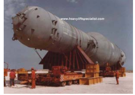
Transport and lifting work for Saudi Aramco