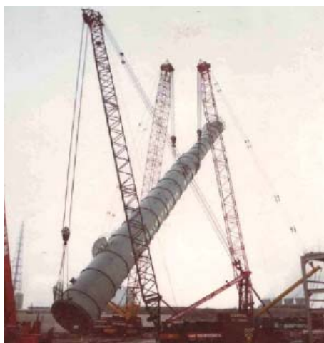
Lifting of a 330 tons CO2 tower at NSM in Sluiskil