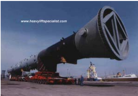
Transport of a 725 Tons column