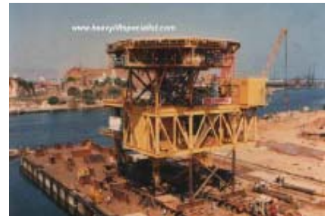
Load-out of 2x700 tons Offshore desk at Hindustan Shipyard in Visakapatnam, India